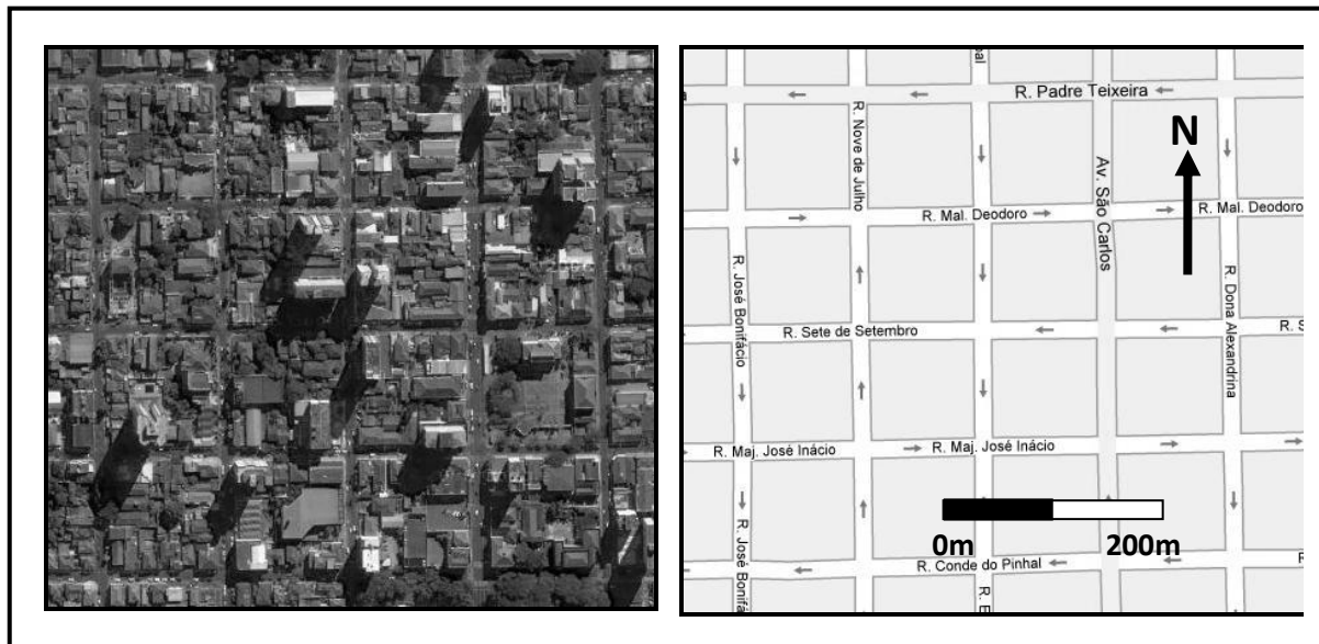
Figure 1: The Sao Carlos study area – aerial and road map

The Brazil trial assessment was performed in an inner city area of Sao Carlos, a medium sized Brazilian city of approximately 200,000 residents. A visual inspection was performed and the study area was estimated to contain approximately 893 house units (one unit equals one bedroom house, two units equals two bedroom house etc.). Applying the Brazilian medium for the South East region of Brazil (IBGE, 2006a) of 1.9 people per bedroom (unit) gives an estimated population for the study area of 1696 residents. The study area comprises 16 blocks of mixed land uses, in a grid format of one way roads as illustrated in Figure 1 .